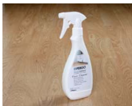
Specially developed laminate Spray cleaner