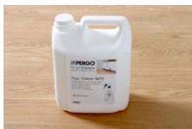
Refill for the Spray