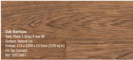
Oak Barrique Type: Plank 1 Strip/4-way BV Surface: Natural Lin Format: 173 x 2200 x 13.5mm (3.05 sq.m) Fit: Top Connect Ref: 50523667