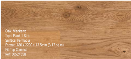
Oak Markant Type: Plank 1 Strip Surface: Permador Format: 180 x 2200 x 13.5mm (3.17 sq.m) Fit: Top Connect Ref: 50524558