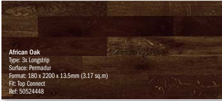
African Oak Type: 3x Longstrip Surface: Permador Format: 180 x 2200 x 13.5mm (3.17 sq.m) Fit: Top Connect Ref: 50524448