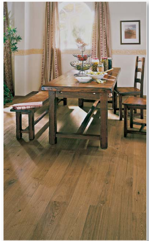
Smoked Oak (Plank)

Equipped with leading Top Connect installation system, Haro is installed in the same way as a laminate floor saving you time and money and is the perfect natural timber product for under floor heating systems.