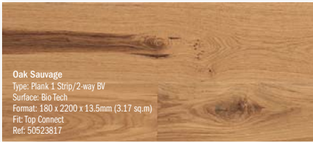
Oak Sauvage Type: Plank 1 Strip/2-way BV Surface: Bio Tech Format: 180 x 2200 x 13.5mm (3.17 sq.m) Fit: Top Connect Ref: 50523817