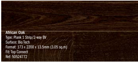
African Oak Type: Plank 1 Strip/2-way BV Surface: Bio Tech Format: 173 x 2200 x 13.5mm (3.05 sq.m) Fit: Top Connect Ref: 50524772