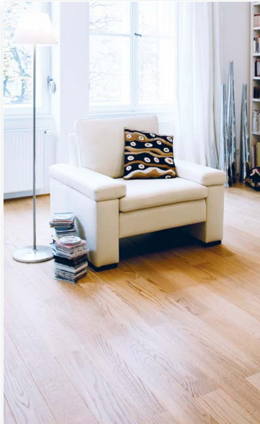
Oak Polar White (Toscana Plank)