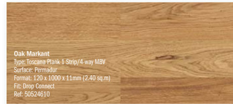
Oak Markant Type: Toscana Plank 1 Strip/4-way MBV Surface: Permador Format: 120 x 1000 x 11mm (2.40 sq.m) Fit: Drop Connect Ref: 50524610