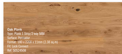
Oak Plank Type: Plank 1 Strip/2-way MBV Surface: Permador Format: 180 x 2200 x 11mm (2.38 sq.m) Fit: Lock Connect Ref: 50524508