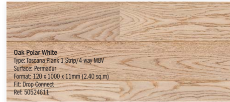
Oak Polar White Type: Toscana Plank 1 Strip/4-way MBV Surface: Permador Format: 120 x 1000 x 11mm (2.40 sq.m) Fit: Drop Connect Ref: 50524611