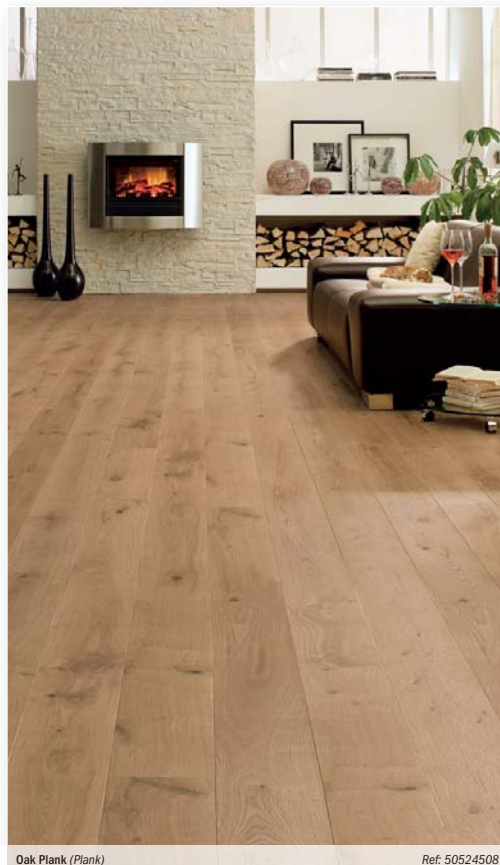
Oak Plank (Plank)

Haro 3000 has a 2.5mm precious wood top layer with HDF core and spruce balancer and comes with Haro's popular Lock Connect jointing system.