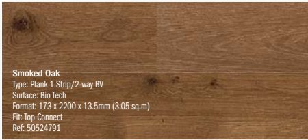
Smoked Oak Type: Plank 1 Strip/2-way BV Surface: Bio Tech Format: 173 x 2200 x 13.5mm (3.05 sq.m) Fit: Top Connect Ref: 50524791