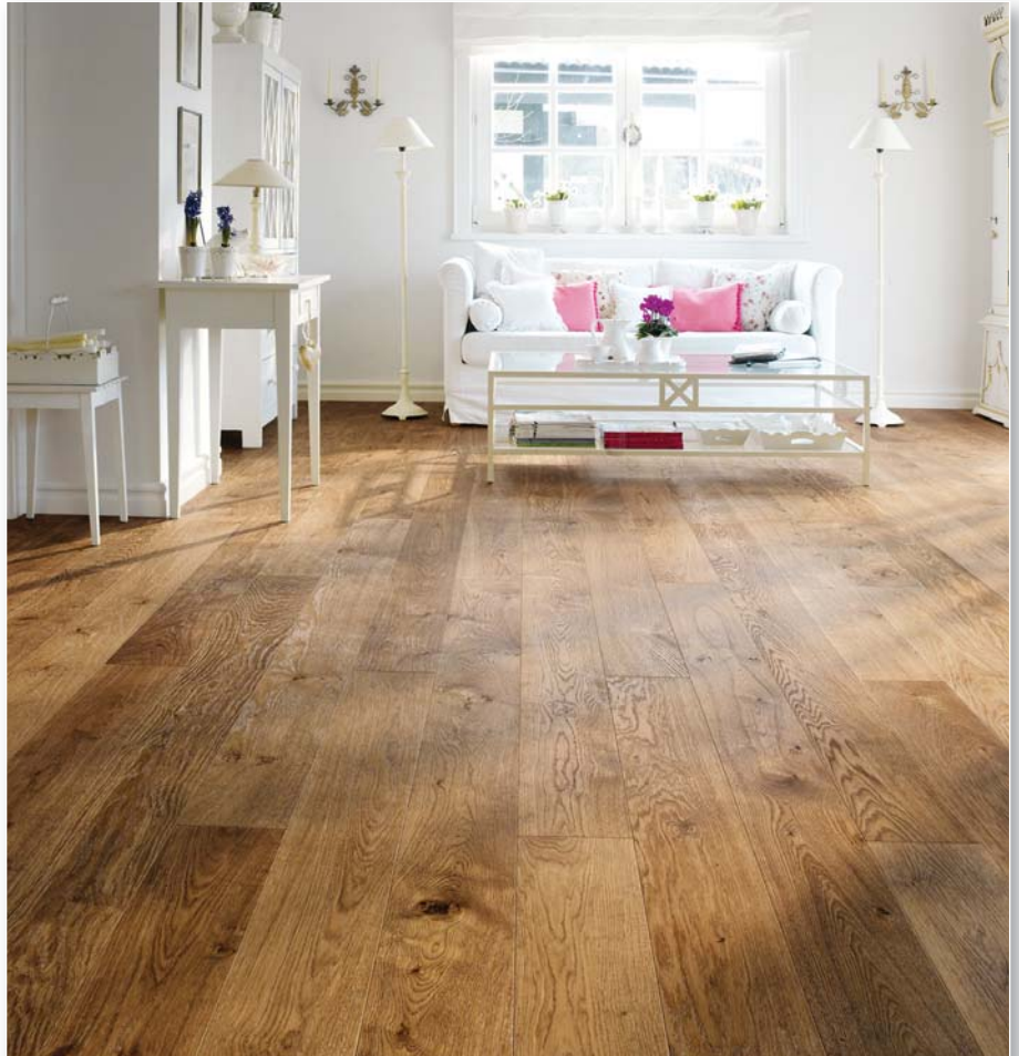
Oak Barrique (Plank)