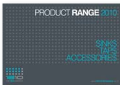
A4 1810 brochure available on request.