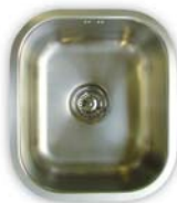
Etrouno 340U EU/34/U/MS/035 - 59