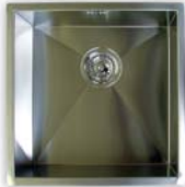
Zenuno 400U Deep ZU/40/U/D/S/71 - 156