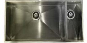
Zenduo Grande Deep 700/180U ZD/7018/U/D/S/072 - 370