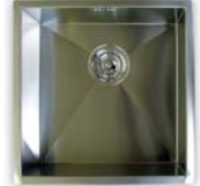
Zenuno 400U ZU/40/U/S/019 - 125