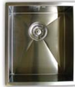
Zenuno 340U Deep ZU/34/U/D/S/70 - 140