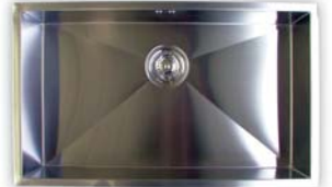
Zenuno 700U ZU/70/U/S/023 - 220