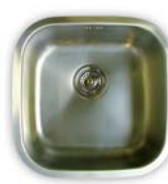
Etrouno 400U EU/40/U/MS/036 - 63