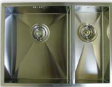
Zenduo 340/180U ZD/3418/U/S/022 - 220