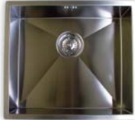
Zenuno 450U ZU/45/U/S/020 - 128