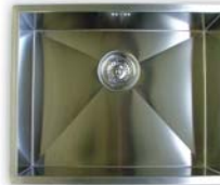
Zenuno 500U ZU/50/U/S/021 - 138