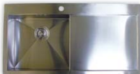
Zenuno 51-F ZU/51F/S/BBL/039 - 300