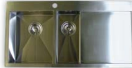
Zenduo 61-F ZD/61F/S/BBL/038 - 355