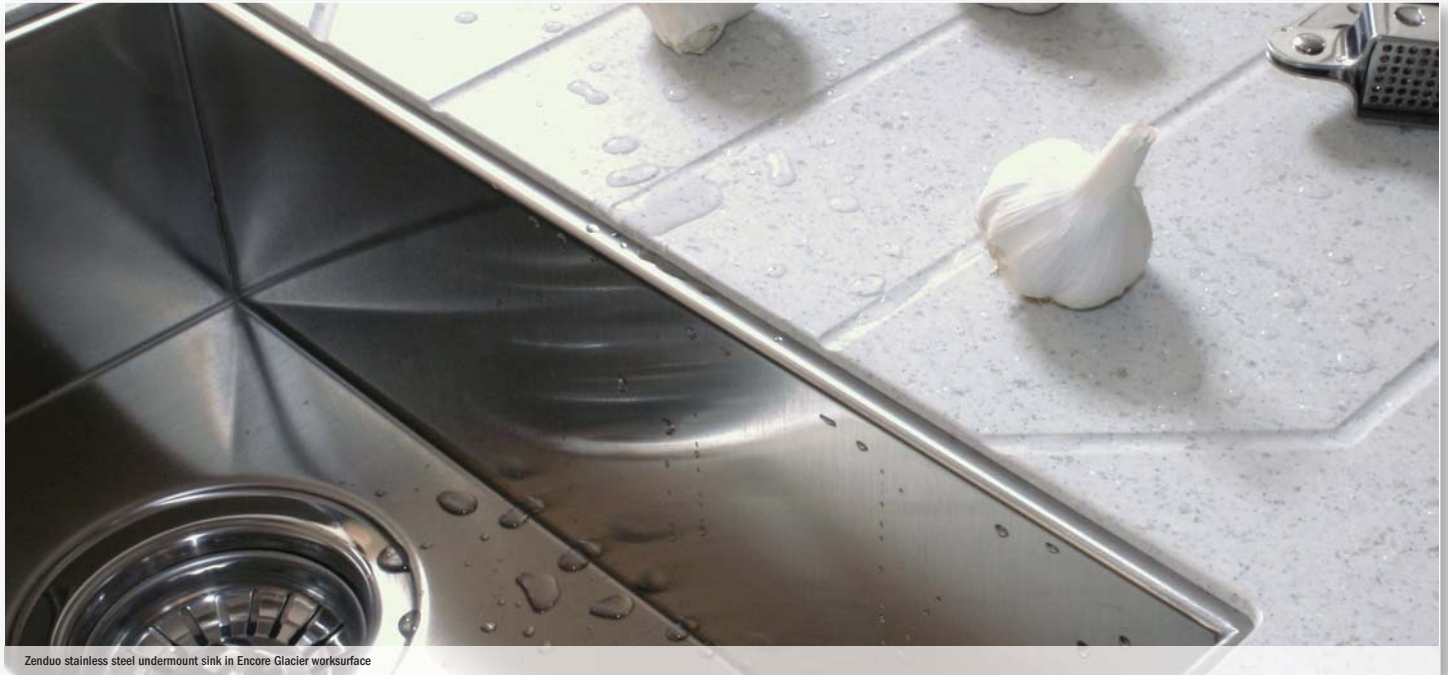
Zenduo stainless steel undermount sink in Encore Glacier worksurface