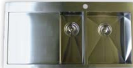
Zenduo 61-F ZD/61F/S/BBR/027 - 355