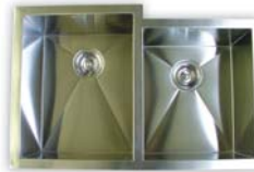
Zenduo 356/343U BBL ZD/3534/U/S/BBL/028 - 350