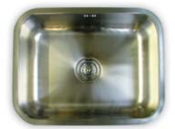
Etrouno 550U EU/55/U/MS/037 - 72