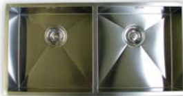
Zenduo 400/400U ZD/4040/U/S/025 - 265