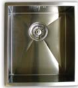
Zenuno 340U ZU/34/U/S/018 - 112